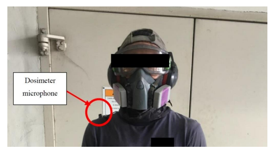
Fig. 1. Example for the position of a microphone attached to a subject

Before conducting the monitoring, the noise dosimeter was calibrated at the work-place. Then, the dosimeter was installed on the subject's body and the microphone was mounted on the top of the shoulder approximately 0.1 m from the entrance of the external ear canal at the side of the most exposed ear and approximately 0.04 m above the shoulder. Finally, the cable was attached neatly and safely as long as the subject felt comfortable and free to move while conducting any kind of work or activities.