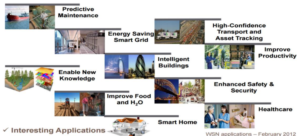
Figure 1.2: WSN Application [3]

WSN mostly use two famous protocols for network connectivity and transmissions namely ZigBee and IEEE 802.15.4. Both the protocols the max coverage range is between 50 – 100 m. Both the protocols were introduced to support low data rate applications. However, Both the technologies got merged later with the name of ZigBee. ZigBee is a low cost and low power connectivity solution with also power efficient solution for low power applications. Due to its diversity of applications this research also uses ZigBee protocol for data transmission and network connectivity between nodes.