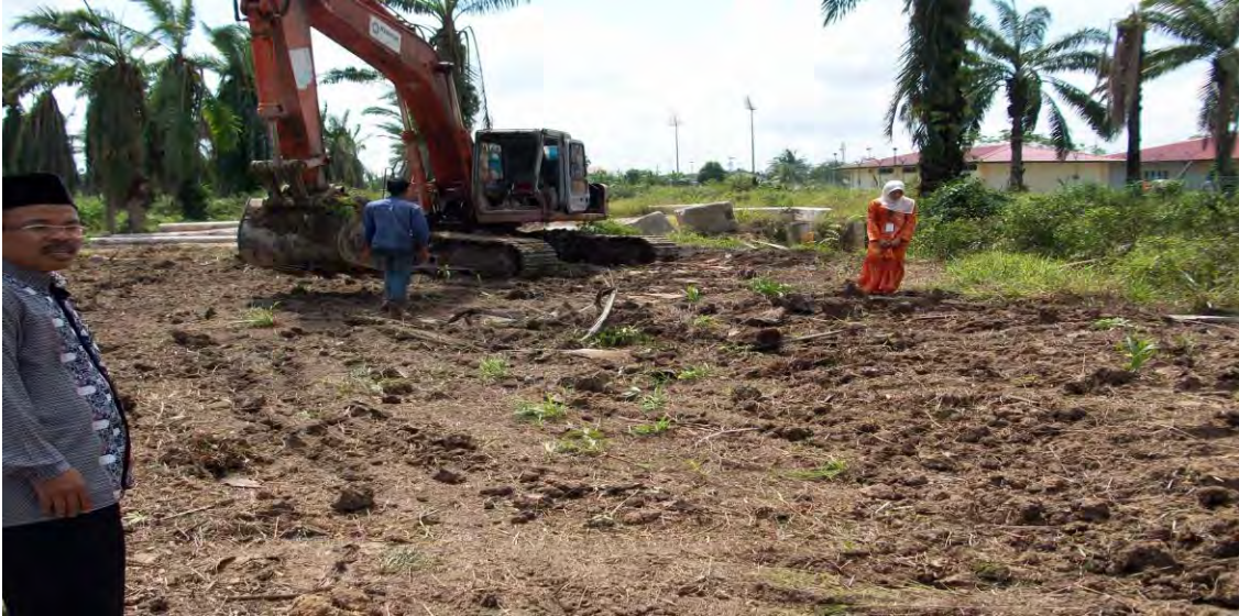
Figure 1.3: Location of sampling in RECESS, Malaysia