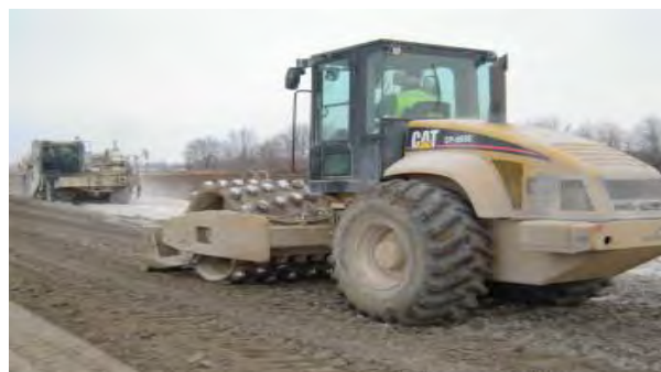
Figure 2.5: Initial compaction (pad foot) followed by final compaction (steel wheel) (Holt, 2010)