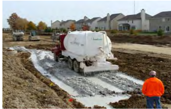
Figure 2.3: Spreading of hydraulic binder as a powder and as a slurry (Holt, 2010)