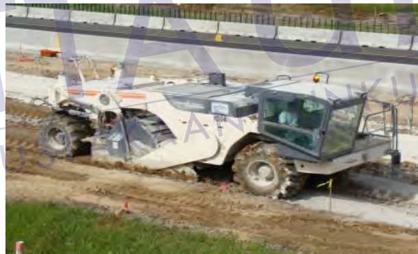
Figure 2.4: Self-powered rotary mixers blending host soil and hydraulic binders (Holt, 2010)