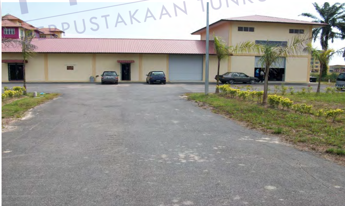
Figure 1.2 : Research Centre for Soft Soil building