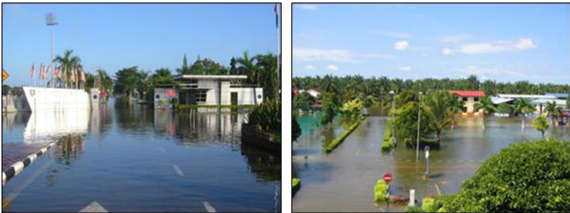
Figure 1.2 : Flood at UTHM in the end of 2006

Department of Irrigation and Drainage Malaysia (DID), the flood occurred due to rainfall intensity was too high at Bekok Dam and Sembrong Dam with the average range of 229 mm/day – 247 mm/day. Furthermore, the storage capacity for stormwater was insufficient where the maximum water level has raised up to 12% - 14% at both dams (Musa et al. , 2009). During rainy season, UTHM is vulnerable to flood by an average water depth of 0.5 m and an average rainfall intensity of 2,400 mm/year (Tunji et al. , 2011).