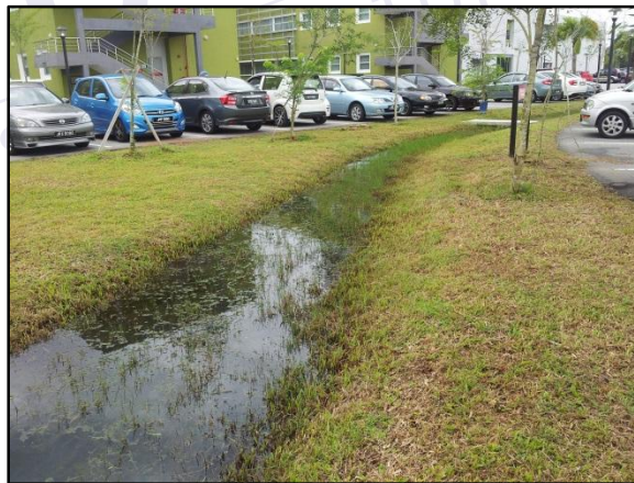
Figure 1.1 : Grassed swale adjacent to parking lot in UTHM

Universiti Tun Hussein Onn Malaysia (UTHM) has applied the grassed swales around the campus as an effort to curb the flash flood issue since UTHM is located in a lowland area. Figure 1.1 shows one of the grassed swales within UTHM campus. This study was carried out to assess the performance of swales as a stormwater quantity control. The findings from this study implicate the flow discharge of swale and its hydraulic resistance, and provide the consideration design that can be use as reference for planning and construction of swale in the future.